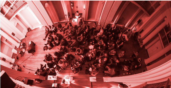
Figure 1 A performance of Fields at the Talbot Rice Gallery in Edinburgh

Another related piece, Atau Tanaka's Global String [7] takes the form of a giant, international, stringed instrument. He uses a global networked connection as a 'resonant body', allowing two different sites to communicate through a suspended string. Tanaka has described creatively embellishing technical limitations such as latency, as 'creative material'. This consideration of technical issues ties in with our approach to the sound design of Fields where we used the network latency as artistic material rather than a restriction (this point is expanded later in this paper). Both Contact and Global String provide examples of artistic interests in approaching spatialised sound work that Fields builds upon.